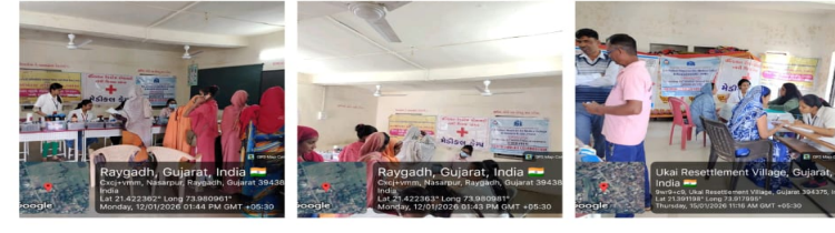
Raygadh, Gujarat, India Cqjwvww, Nandarpur, Raygadh, Gujarat 384348, India Lat 21.422362° Long 73.880911° Monday, 07/04/2026 01:48 PM GMT +05:30