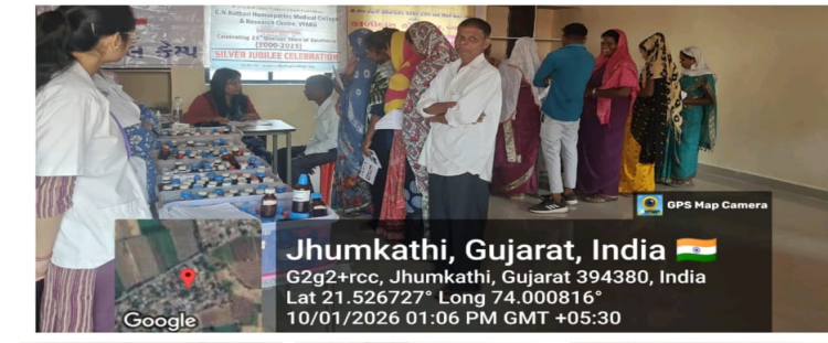
Jhumkathi, Gujarat, India G2g2+rcc, Jhumkathi, Gujarat 394380, India Lat 21.526727° Long 74.000816° 10/01/2026 01:06 PM GMT +05:30