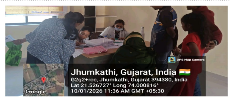
Jhumkathi, Gujarat, India G2g2+rcc, Jhumkathi, Gujarat 394380, India Lat 21.526727° Long 74.000816° 10/01/2026 11:36 AM GMT +05:30