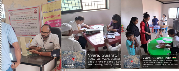
Vyara, Gujarat, India 499w-vjg, Vyara, Gujarat 384850, India Lat 21.119553° Long 73.396977° Wednesday, 01/04/2026 10:22 AM GMT +05:30