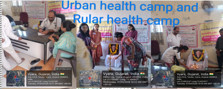
Vyara, Gujarat, India 3cjc-hn4, Taluka, Vyara, Gujarat 384852, India Lat 21.081238° Long 73.4214° Tuesday, 07/04/2026 10:57 AM GMT +05:30