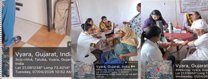
Vyara, Gujarat, India 3cjc-hn4, Taluka, Vyara, Gujarat 384852, India Lat 21.081238° Long 73.4214° Tuesday, 07/04/2026 10:52 AM GMT +05:30